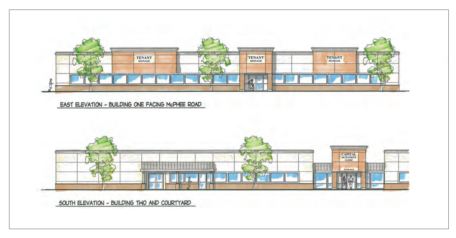
Artist's Rendering of Capital Medical Center Expansion

the process, Rush found a former manufacturing facility in Tumwater that met the space and location needs of the school district. Once the ESD approved their potential new home, Rush purchased and renovated the site, then sold it to the ESD. Part of the purchase price was trading the property next to the hospital. "It was very complicated, very multi-layered," said Rush. "There were a lot of legs in the transaction, but the success all stemmed from need. Each participant had specific needs, and we were able to bridge the gaps, bringing expertise and